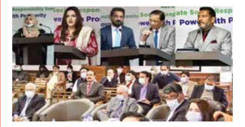
January 18, 2021: Chairman NEPRA & Speakers PAEC & Engro Energy addressing the Participants of Webinar on Corporate Social Responsibility (CSR) at NEPRA Tower, Islamabad.

January 08, 2021: Chairman NEPRA in a discussion Session with Professionals from Renewable Energy Sector and Academia regarding Micro Grids