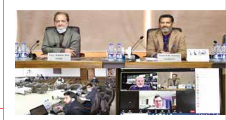
January 29, 2021: Webinar/Seminar on Economic Merit Order and System Operation

January 08, 2021: Chairman NEPRA in a discussion Session with Professionals from Renewable Energy Sector and Academia regarding Micro Grids